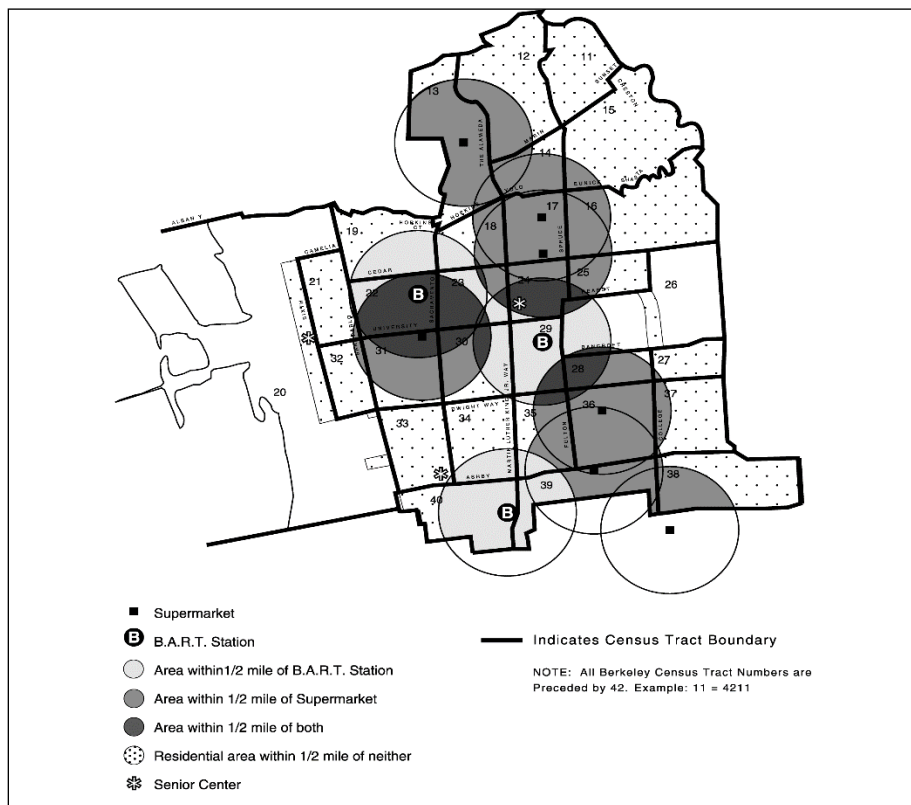
Figure 23 shows the distribution of certain services and community facilities throughout the city.

Berkeley commercial districts are as strong as or stronger than they were in 1977. Business license tax receipts reached an all-time high in 1998, reflecting an increase of 12.3% over 1996. Hotel tax receipts also reached an all-time high in 1998, while commercial, residential, and industrial property vacancy rates fell to single digits. Berkeley's neighborhood and avenue commercial districts include a large number of specialty stores and services that attract customers from outside the surrounding neighborhoods.